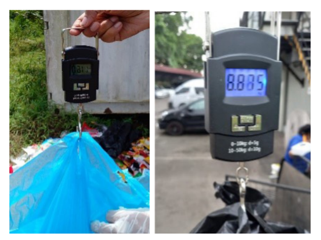
Figure 4 : Sample analysis at Karadiyana and Biyagama EPZ

feature article in the National Geographic [2]. The cubes were from around the world and highlighted several things about biodiversity in small spaces, including a staggering number of nook and cranny species . Amost every cubic foot sampled yielded hundreds of species.