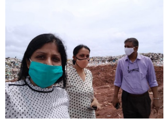
Figure 5 : Waste inspection visit at Karadiyana waste site