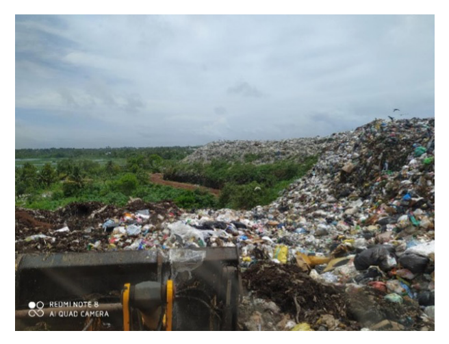
Figure 2: Karadiyana Waste site