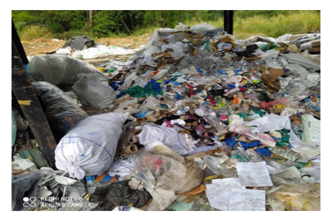
Figure 3: Mixed waste at Biyagama Industrial Zone