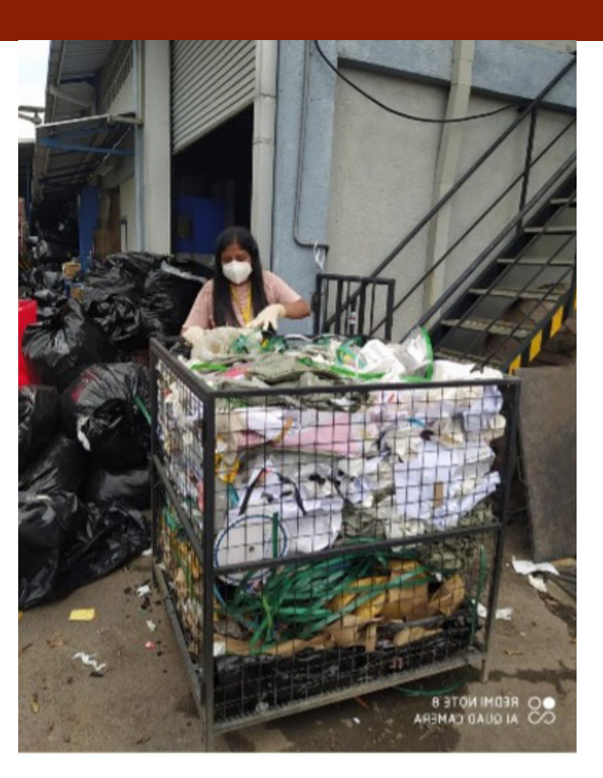
Figure 7: Waste analysis at Biyagama EPZ

The Economic value of one cubic meter volume of industrial waste was approximately 1622 LKR. The Cube also enabled industry to identify the potential almost immediately.