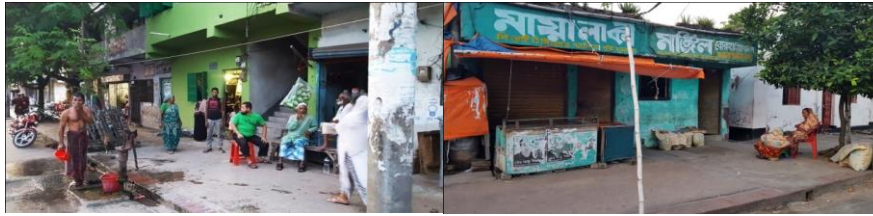
Figure 7, Permeability of urban form makes the environment more amiable for spending leisure time