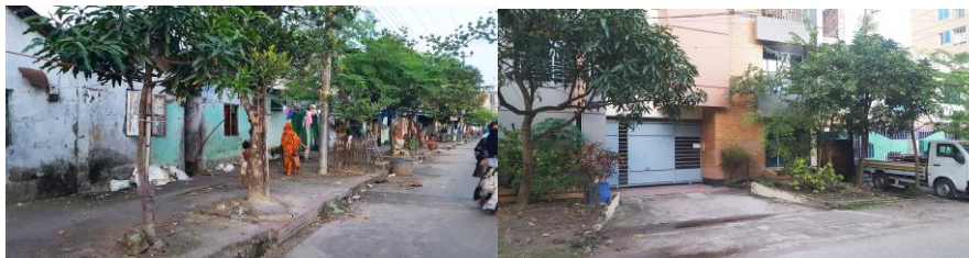
Figure 6, Road side vegetation promote the human interaction and mass gathering

Although, buildings from the present time do not keep open space for maximizing spatial usability, on the other term, capitalize the monetary value. Specifically the real estate companies take advantages from land, even violates the construction rules and regulations during construction time. Absence of open spaces brings monotonous built environment at plot and settlement level. Similarly, the vegetation types impact on human psychology