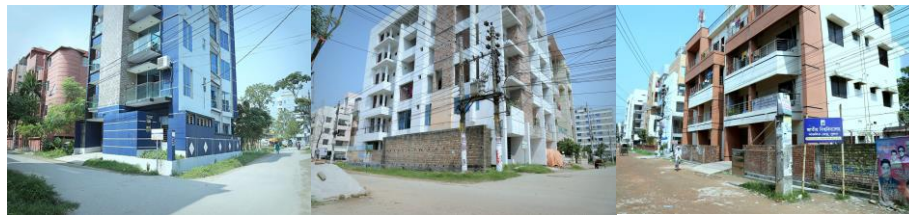
Figure 5, All blocks ( Sonadanga ) are showing same kind of monotonous façade and spatial development

diverse social group. The absence of diversity also does not meet the needs of different age group, similarly; (figure 5) shows a common pattern of layout makes the area more monotonous. Mixed-use ensures the accessibility of different aged group, such as, adolescent, working people, retired, etc. that produce an active place in different periods. In urban place making this crowding is vitality ensure safety and security of a place which exists in Nirala no: 1 road. The vibrancy averts crimes, social unrest and increases social surveillance that implies a key indicator in designing public realm, however, is significant to welcome all social groups to participate in diverse activities.