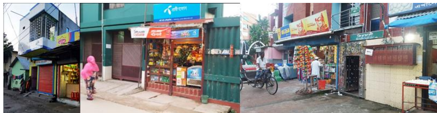
Figure 3, The ground floor is using for different purposes based on community needs, (Source: Authors constructed)

An alternative scenario has found at 2nd phase of Sonadanga residential area, although, both areas have been developed by Khulna Development Authority under the constitution of site and service scheme. Due to the location in respect of the city, the land price is growing tremendously since last decade which does not allow different social class. A recent study shows that mostly the upper-middle class and middle class can afford this living cost of Sonadanga and these categories have a similar choice about the spatial level which reflects by way of their living. Only a few diverse functions have developed, which are not sufficient to attract gathering (Figure 2b). Mostly those functions are being developed by the own interest of the owner, although the development authority does not permit mixed-use growth in a planned residential area.