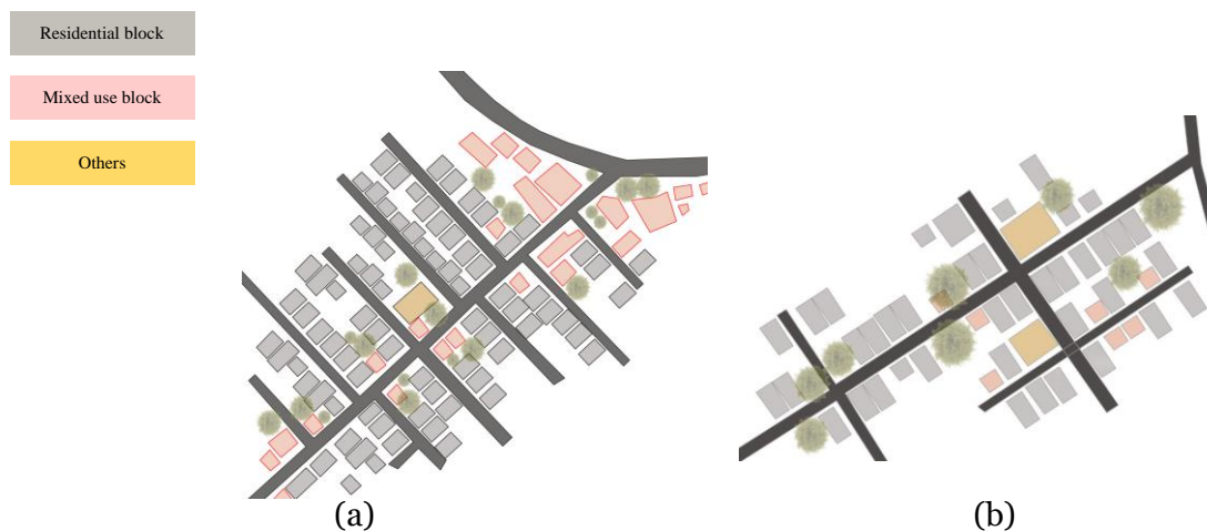
Figure 2, The left one showing the land use of Nirala (a portion) and right one showing land use of 2 nd phase of Sonadanga

In most cases, the mixed-use quality evokes different types of land uses which are directly connected with the human needs and ensure active sharing within different stakeholders. From the definition about the urban form of Kevin Lynch , the first studied area Nirala no.1 road , shows different land uses that have been being developed since last two or three decades. Figure 2, presents diversified functions have grown to satisfy the users. Initially, the area was developed as residential purposes which have been transforming into a mixed land use zone through time factor (Figure 2a). At neighborhood-scale, the functional diversity provides services to dwellers all day long that make the area more vibrant at a different time of the day. Particularly two major crowding develop at Nirala no.1 road ; one is at early morning where people come to buy fresh vegetables which have grown at the pedestrian level. On the other hand, during late afternoon some other services, such as roadside snacks, moveable seasonal fruits have developed. Along with these, coaching, individual doctor chamber, grocery shops have generated at the ground level of the buildings that make bridge connectivity between neighborhoods to the neighborhood.