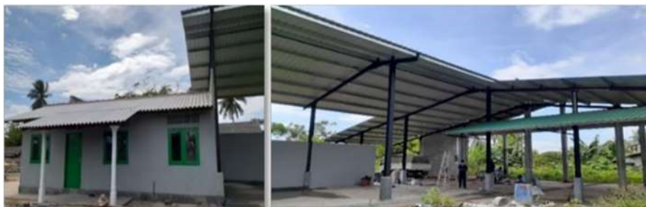
Figure 1: Wattala MRF center