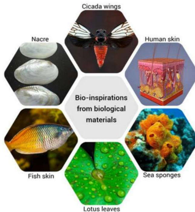
Fig. 2. Inspirations from Nature

Several bio inspirations have been adopted to develop unique MXene structures for the above-mentioned applications. Nacre's hierarchical 'brick-and-mortar' architecture provides mechanical strength and bioactivity, inspiring applications like high-performance materials and thermistor sensors. Fish skin's flexibility and mechanical robustness lead to biomimetic fish skin materials and sensitive electronic devices for underwater use. Lotus leaves, known for their superhydrophobic and self-cleaning properties, inspire coatings and tactile sensors. The porous and interconnected structure of sea sponges is mimicked in glucose detectors and robust supercapacitors. Human skin's complex sensory and mechanical properties inform the creation of electronic skins for healthcare applications. Cicada wings' anti-reflection and water-repellent characteristics inspire self-cleaning and antireflection coatings. These bioinspired approaches enable the development of MXene-based materials with advanced functionalities for diverse applications. Some of the most common bioinspiration used in developing bioinspired MXenes structures are given in Fig. 2. [[5], [6], [7], [8], [9].