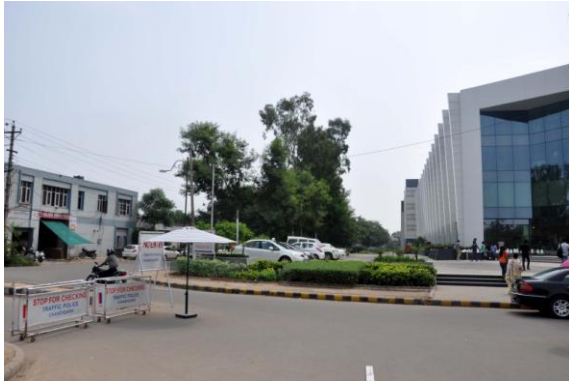
Fig4: Largest shopping mall as a destination In industrial area but facing co existence