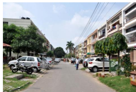
Fig10: Parking problem already visible on Marla houses street in sec-46