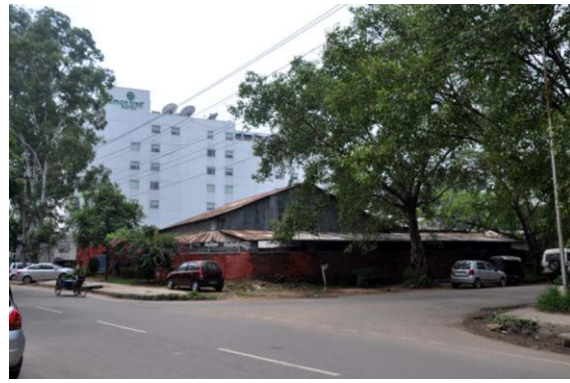
Fig5: chaotic visual environment for New Functions