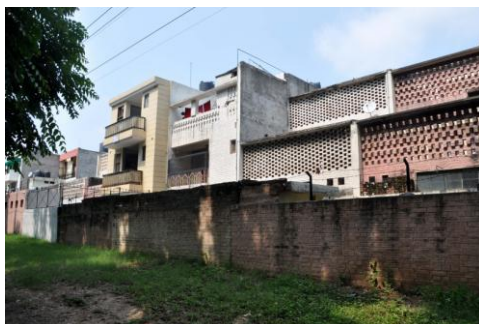
Fig9: V3 Street from ordered terraced to Flattened and chaotic

The increase in the number of households as every plot could have three units will result in road congestion due to traffic increase, but at the same time can result in more livelier streets, the sign of which has started appearing in the few parts of the city.