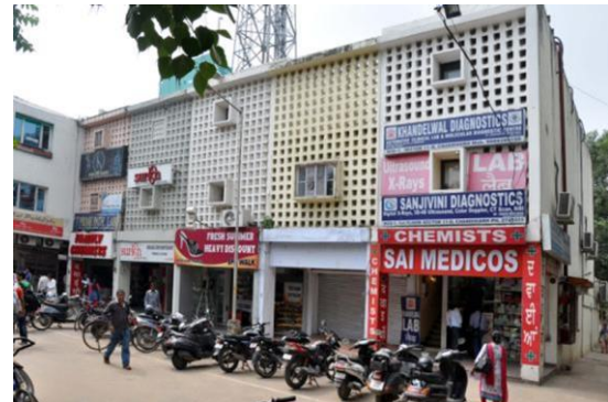
Fig8: Sector -11 market is now most happening place with variety of shops/ activity.