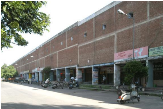
Fig7: Sector-26 is the latest food street of The city changing the visual image

city's visual character. This new buzz has rather created new landmarks and nodes for the citizens which is changing the image for visitors also.