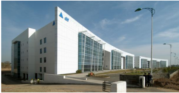
Fig.2 New development in IT Park