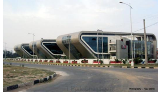
Fig3: Opportunity for new architectural form experiment