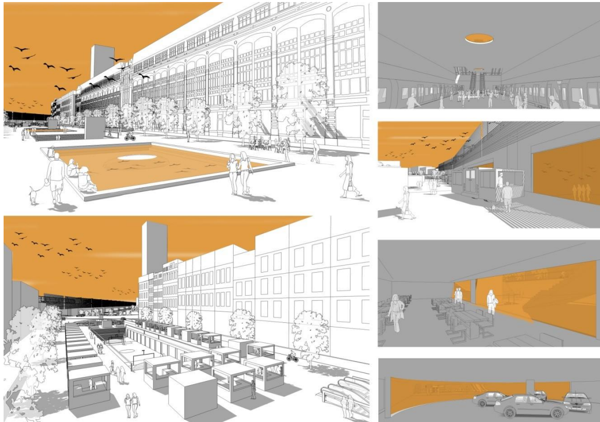
Fig 3: Proposed MetCom Facility

Daylight is a scarce commodity in underground construction. However, in the project penetration of daylight into the underground is considered with utmost importance. Voids of 5m diameter in the roof of the metro station allow penetration of sunlight to the platforms. The commuters inside the metro station could not only see the sky and get light, but also see the activities happening outside makes the interactions ever more interesting. This quality is achieved by carefully using the staircases to create angles in the floors above.