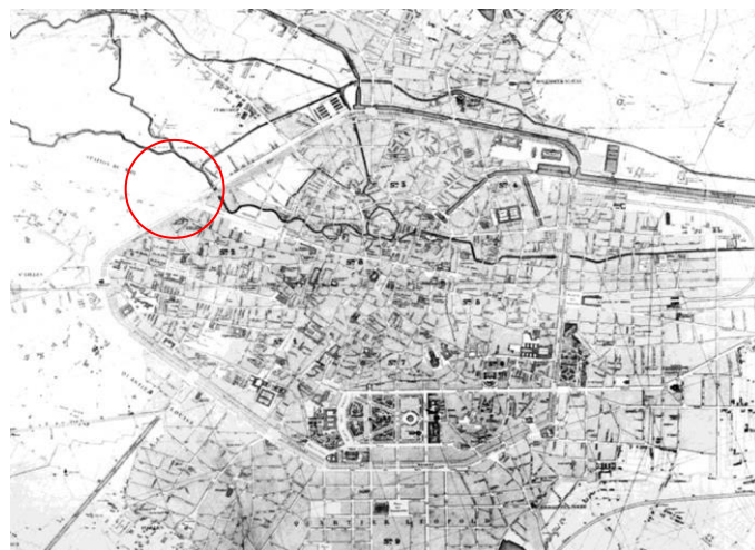
Fig 1: Historical map of Brussels indicating the neighbourhood of Fountains

Neighbourhood of Fountains, which lays just outside the historical city of Brussels, is located mainly in the valley of the former river Senne. During the 16 th – 19 th century, located largely in swampy areas, the neighbourhood was serving as crop and livestock supply to the city.