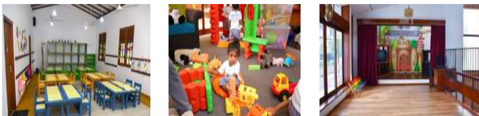
Figure 5 - Photos of Kidsdom Preschool

For the observations two preschools were chosen. These preschools were chosen because both have the same properties as, both are in Colombo, private preschools and both follow the AMI teaching system. Data such as furniture types and furniture requirements were analyzed through observation. Observations were made by going to preschool for five consecutive days to observe how children behave and how they respond to different types of furniture. Quantitative