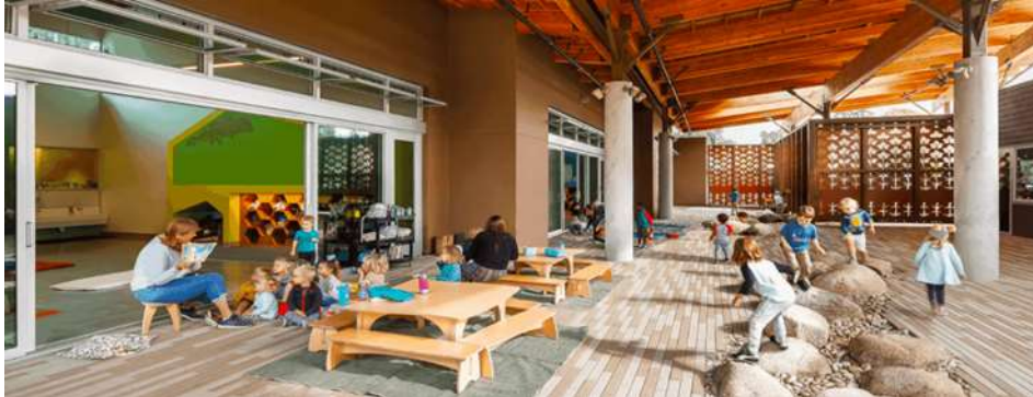
Figure 2 - Award winning sustainable designed preschool in California

Sustainable furniture is made from materials that have as little of an adverse effect on the environment as possible. Natural resources like wood are frequently used to make furniture, and widespread production of this product has adverse impacts on deforestation and greenhouse gas emissions. Sustainable furniture uses eco-friendly materials, such as bamboo, reclaimed wood, and recycled materials, which reduces the need to source new resources. They do not contain hazardous elements like volatile organic compounds (VOCs). Given that furniture is an investment that should be maintained over time, it is even more crucial to consider sustainable furniture pieces that are produced ethically and responsibly (Parker, 2024).