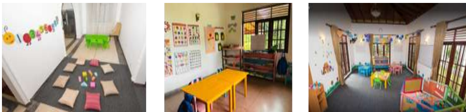
Figure 4 - Photos of Blooms Preschool