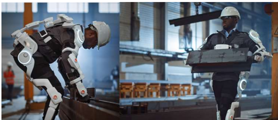
Figure 1: Exoskeleton application for the construction industry

The primary objectives of an exoskeleton are to improve user comfort, reduce the risk of injury, enhance physical capabilities, and optimize efficiency in a range of applications, from manual labour to medical rehabilitation. Therefore, this review article employs human factors principles to identify, classify, and offer potential design improvements in exoskeletons, considering the ergonomics between the wearer and the device. The main benefit of the application of an exoskeleton above any type of robot system (classical robots, full-automation systems, or humanoid robots), would be that, specifically in dynamic environments, one will fully profit from the human's creativity and flexibility, while there is thus no need for robot programming or teaching of robots (de Looze et al., 2016). These products are often heavy and used for longer periods, increasing the risk of causing fatigue and strain disorders. WMSDs are costly for companies and negatively impact the worker's quality of life. Golabchi et al. (2018) suggest that to increase the safety of the workplace, investigating how ergonomic aids could be used and developed for this industry is necessary. The exploration of ergonomic exoskeletons naturally segues into an in-depth examination of the various types available, fostering a comprehensive understanding of the diverse landscape within this innovative field.