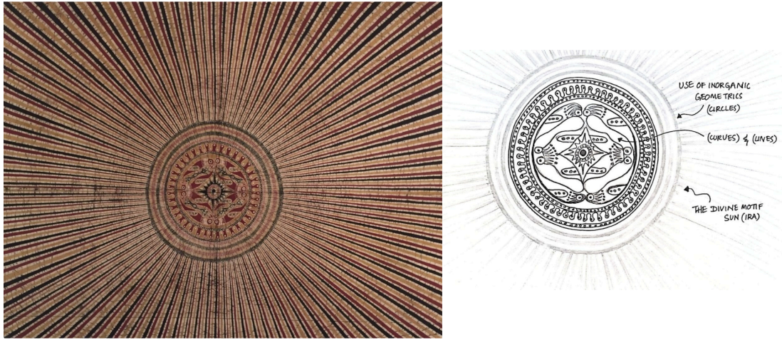
Fig.1 - Traditional motifs adapted in Number 11, Geoffrey Bawa's residence